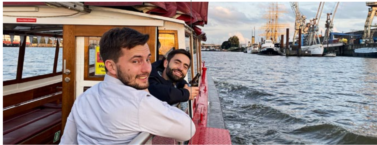
We focus on a pleasant working environment and collegial cooperation.

56% small projects 41% medium projects 3% large projects