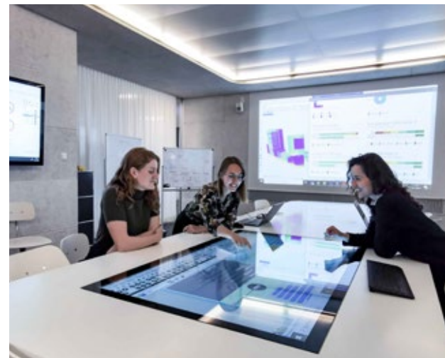
Modern techniques such as BIM services, early stage design, digital twin and drones are part of our everyday planning.