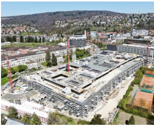
The new Children's Hospital in Zurich was designed by Herzog & de Meuron – our specialists ensure its realisation.