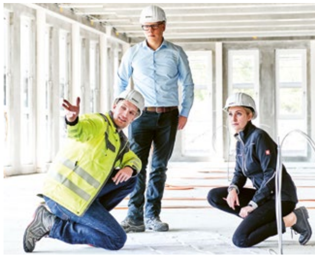
Realize projects together as a team and develop new innovative solutions for the buildings of tomorrow.